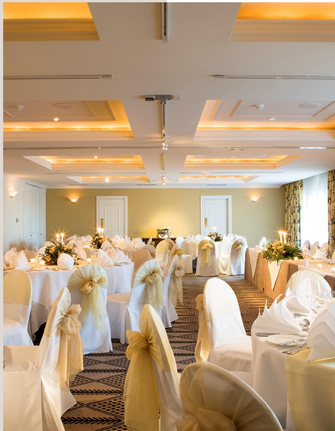
THE BANKSIA ROOM LILIANFELS HOTEL