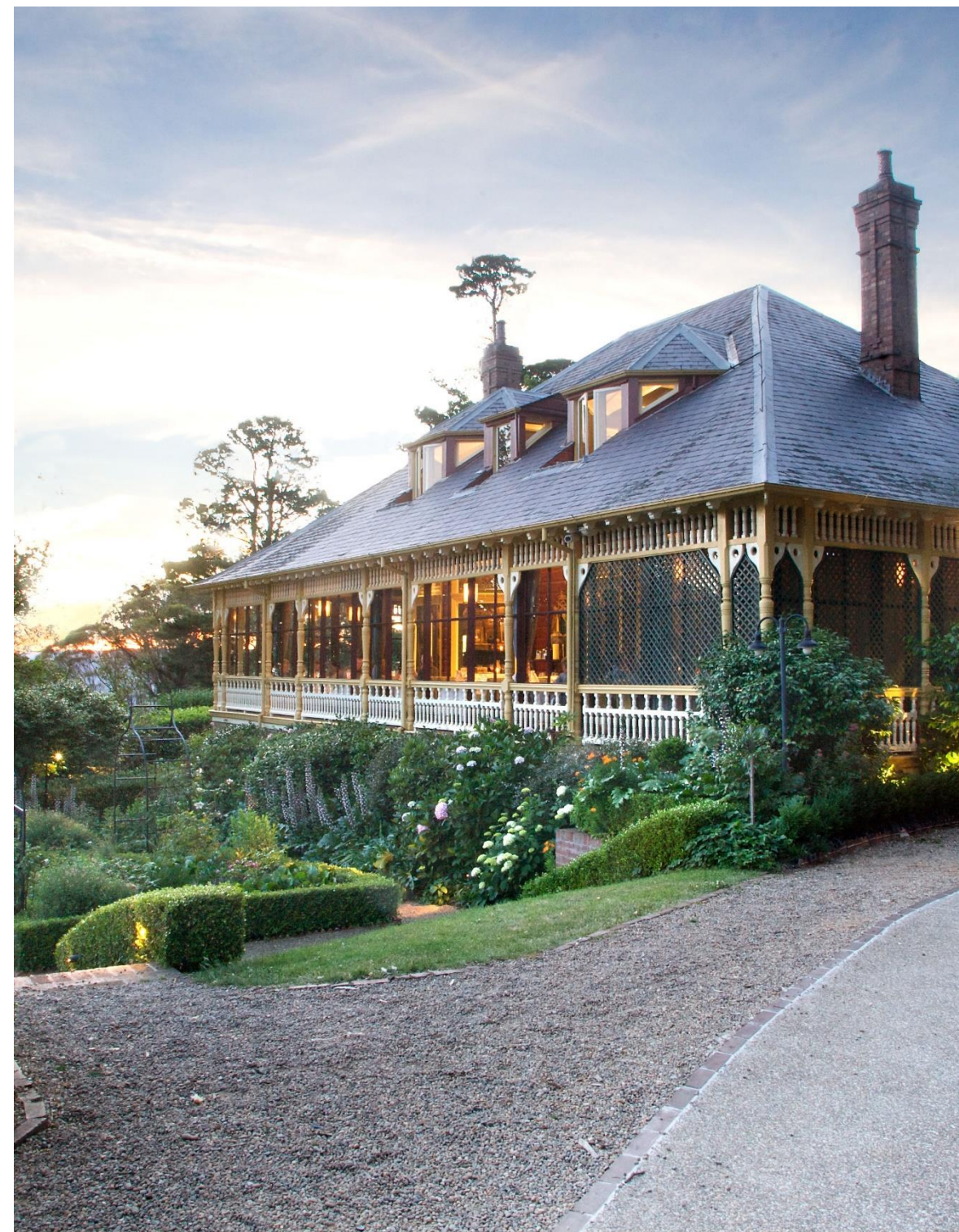
DARLEYS RESTAURANT EXTERIOR