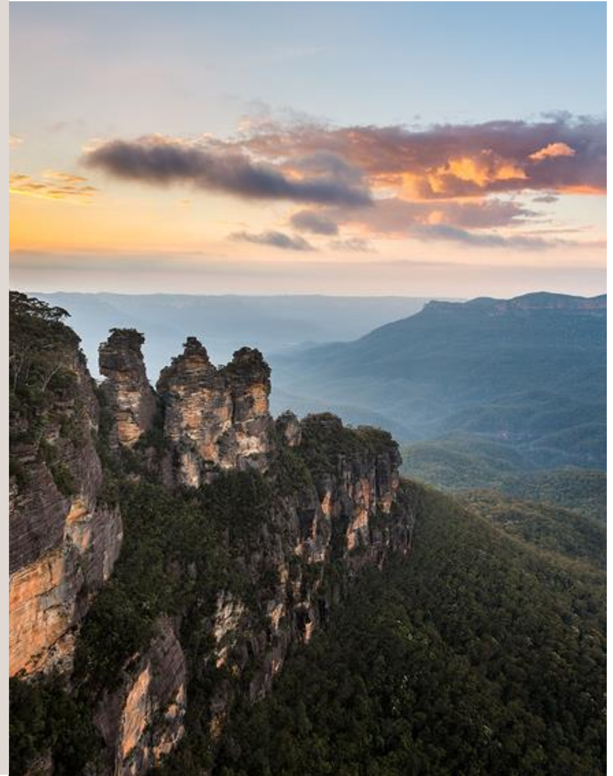
WORLD HERITAGE LISTED BLUE MOUNTAINS NATIONAL PARK