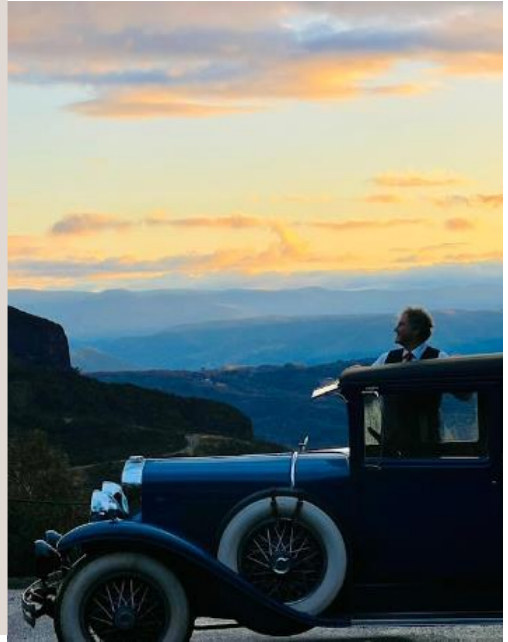
BLUE MOUNTAINS LIMOUSINES & VINTAGE CADILLACS