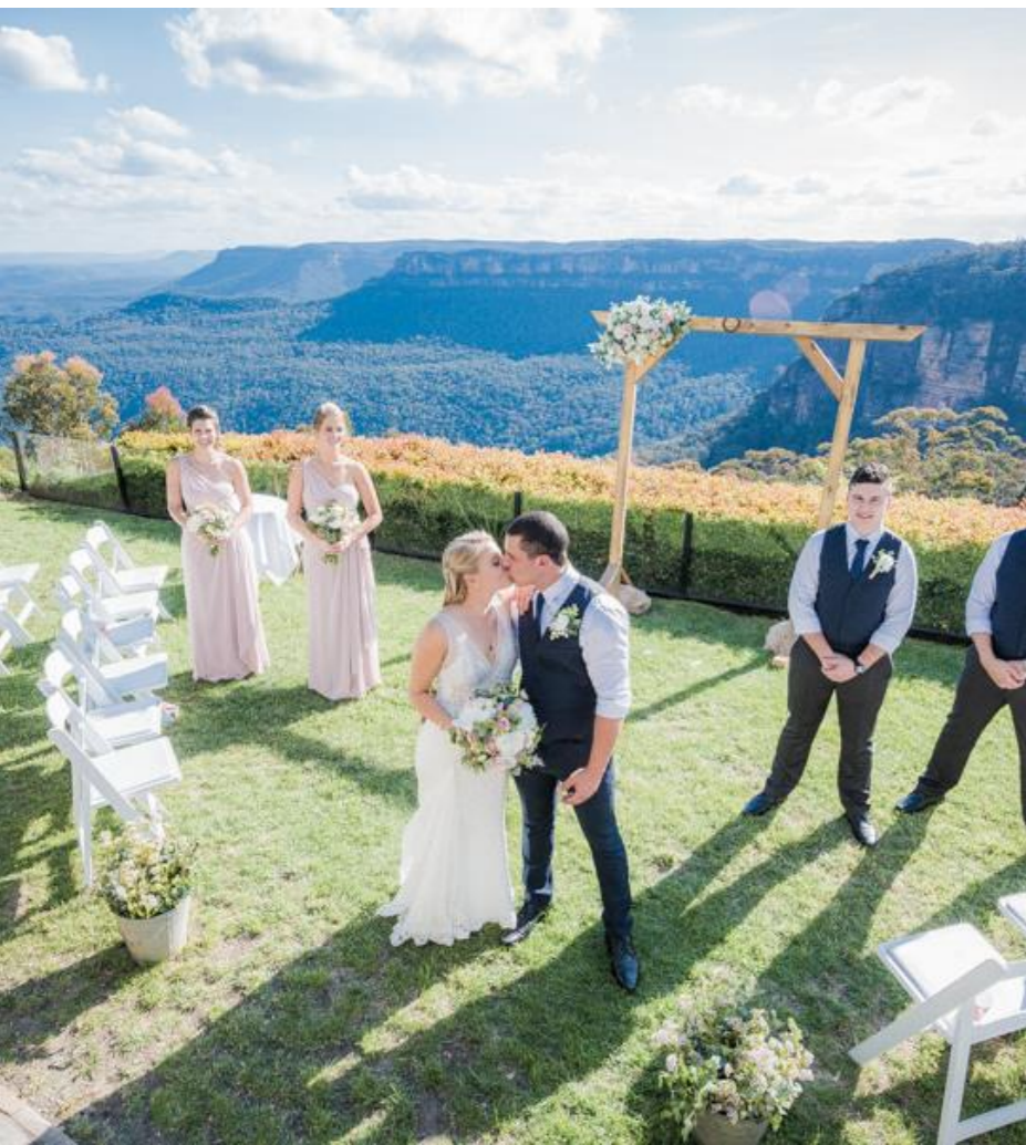
CLIFF TOP GARDEN