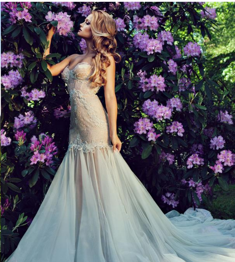
ECHOES SURROUNDING GARDENS