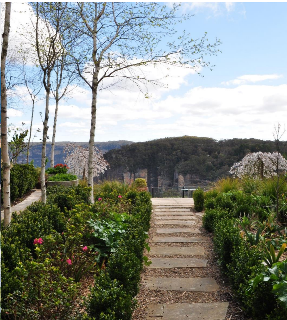
CLIFF TOP GARDEN PATHWAY